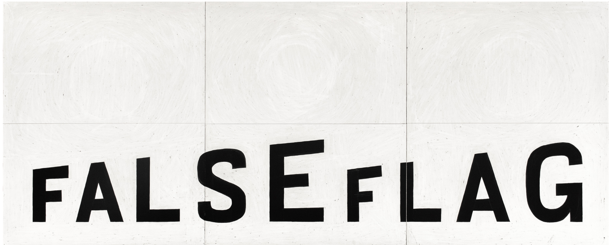
False Flag , 2024, scrapboard, unique work. 70 x 157.5 cm (framed).

Untitled (Souls 6) , 2024 single-channel video, audio 109 sec